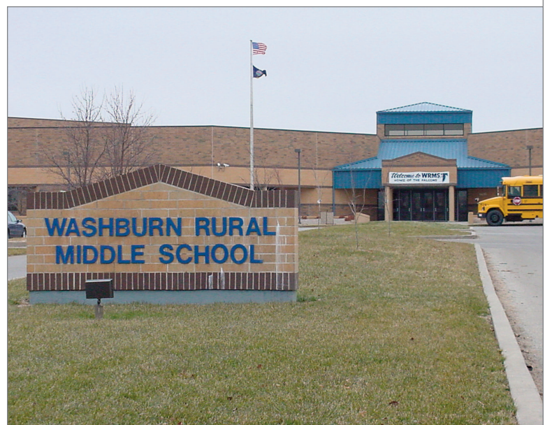
Middle school in Topeka, Kansas saves precious budget dollars with Lexmark solution.

In addition to the costs, these inkjet printers were being called on to generate far more pages than they were designed to deliver. Internet projects, tests, reports, classroom projects, and bulletins stretched the capabilities of the inkjet devices. In addition, teachers and students