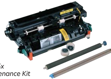
Lexmark T65x Fuser Maintenance Kit

"We help our customers understand why paying a little bit more for a genuine part will yield significantly more life from the printer. That's a good investment."